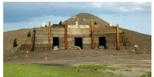
"Wilder Mountain", a ski & play hill as well as a storm shelter. Now completed.

For those who can't get far from their Internet friends or work, the park now has Wi-Fi access.