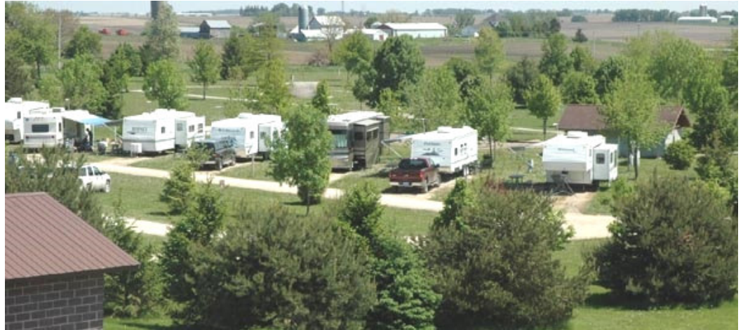
Wilder Park. Notice how the trees have grown since the aerial picture, below, was taken.