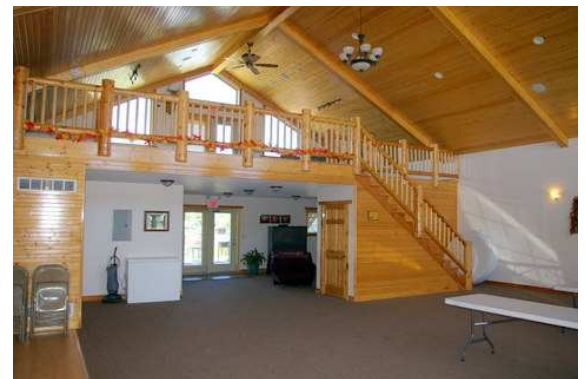
Main room and balcony in Lodge.