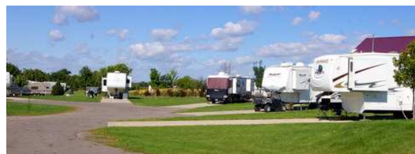
Circle parking. Drive-thru spaces also available.