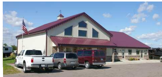
Large Lodge, east end of the

Spray 9x13 pan with Pam. Beat eggs, add milk, mustard and salt. Mix. Add bread and meat or mushrooms. Mix. Pour into pan, leveling out. Sprinkle cheese on top. Cover and refrigerate overnight. Uncover and bake at 325-350 for 45-50 minutes. It should be puffed up and brown on top. Let cool about 15 minutes before cutting to serve.