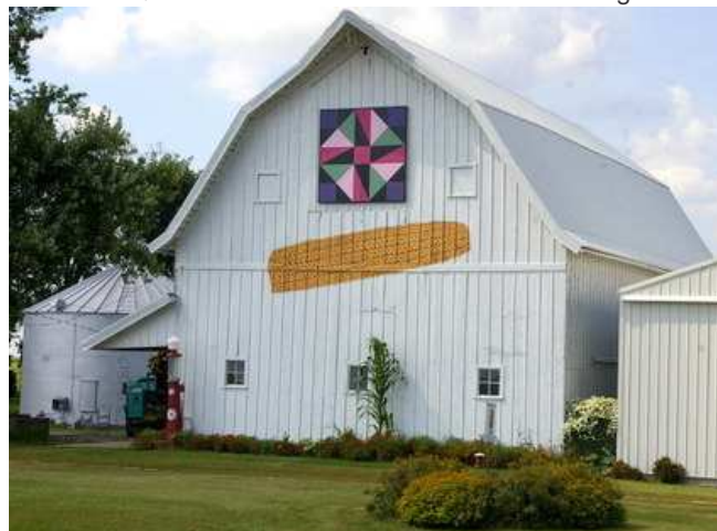
Barn Quilt and ear of corn south of Kalona along IA 1